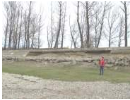
Fig. 3 - State degradation protection of the bank works (year 2014)

Flooding on the river Moldova for 2010-2015 riverbed morphology changed in the Soci area, Iasi County. In 1970 there was minor riverbed into two branches