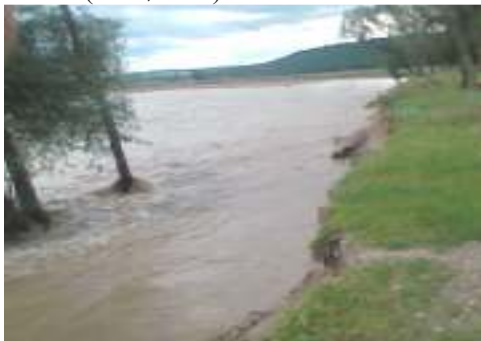
Fig. 2 - Left bank degradation and flood defense works in 2008

The riverbed Moldova transited in 2005 a flood flow of 1168 m^3/s . In 2010 there were two floods: the first summer flow of 660 m^3/s ; the second in autumn flow 965 m^3/s . The effects of floods have resulted in partial degradation of shore defense (Luca, 2012).