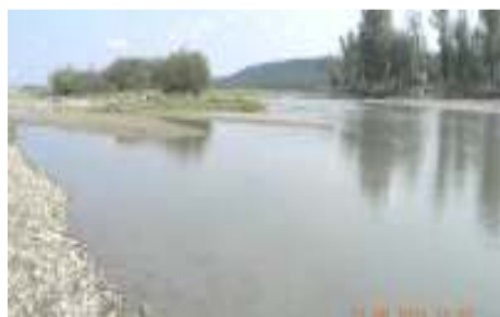
Fig. 5 - Downstream view of the two arms of the river Moldova in the study area

favorable habitat conditions in the minor riverbed Moldova.